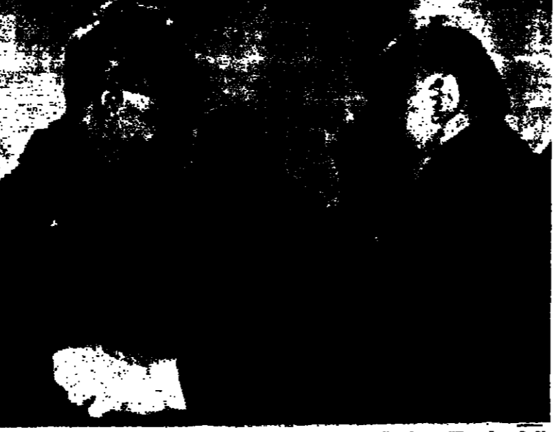
Czech Communist Party Secretary-General Gustav Husak, left, embraces Bulgarian State Council Chairman, Todor Zhivkov, who headed a Bulgarian delegation which arrived in Prague on Monday.